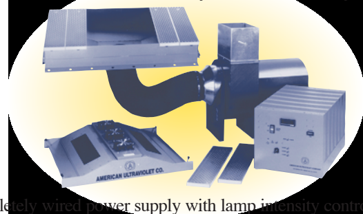
Retrofit "Add-On" Air-Cooled Conveyor-Cure Irradiator System